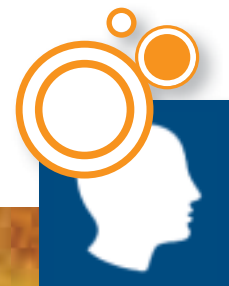
EXHIBIT A HIGH DEGREE OF TRANSPARENCY, COMPLIANCE, AND ACCOUNTABILITY.

Members of governing boards need to monitor the public-policy environment and its implications for the colleges and universities they oversee. They need to be proactive and help their institutions respond to policymakers' concerns about cost, quality, and especially degree attainment. Boards and presidents together need to review the circumstances that have prompted this new government scrutiny—driven mainly by fiscal conditions—examining how their institutions conduct themselves and changing where warranted.